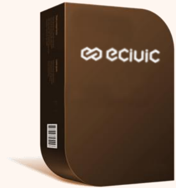
ERP Suite for Urban Governance